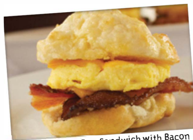
All-American Egg Sandwich with Bacon

Bacon ..... $3.50 Grits ..... $1.99 Sausage Gravy ..... $2.99