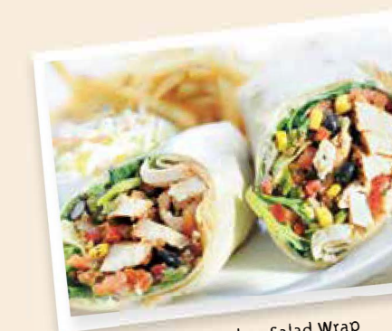
Santa Fe Chicken Salad Wrap

FRESH GOURMET COOKIE PLATTER ..... $19.00