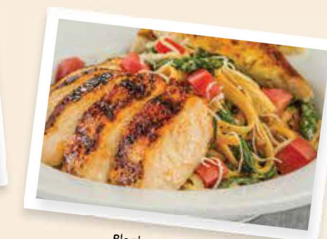
Blackened Chicken Pasta